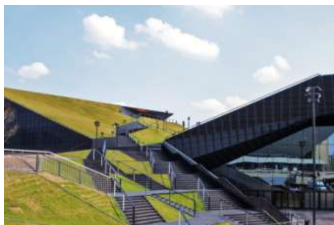
International Congress Centre in Katowice - the place of the InterNanoPoland Conference.